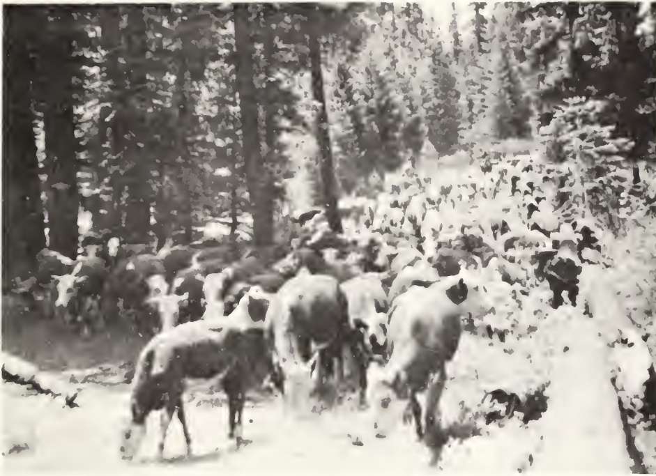
Figure 7. Herd of cattle being driven to summer range on the Rogue-Umpqua divide, circa 1940. The log drift-fence can still be seen just north of the Union Creek Recreation Complex. (RRNF Historical Photograph Collection)

Taken as a class, these sites have moderate cultural resource significance. This is due to several factors: they are quite abundant on the Forest and are certainly not unique to this region. Many have seen continued use by hikers and other recreationists, creating a mix of early and modern features and artifacts. Most (but not all) historic grazing sites probably have only minor potential for professional study. The pattern of their areal distribution is important to the historical geographer and this can be studied from maps. This is not to imply that this site category is unimportant. Grazing sites are remaining physical evidence of an activity which was significant to local inhabitants and the early Forest.